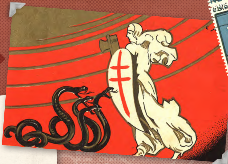
Anti-Tuberculosis Campaign, G. Saccomani, Anti-Tuberculosis Consortium of the Province of Udine, Italy, ca. 1935