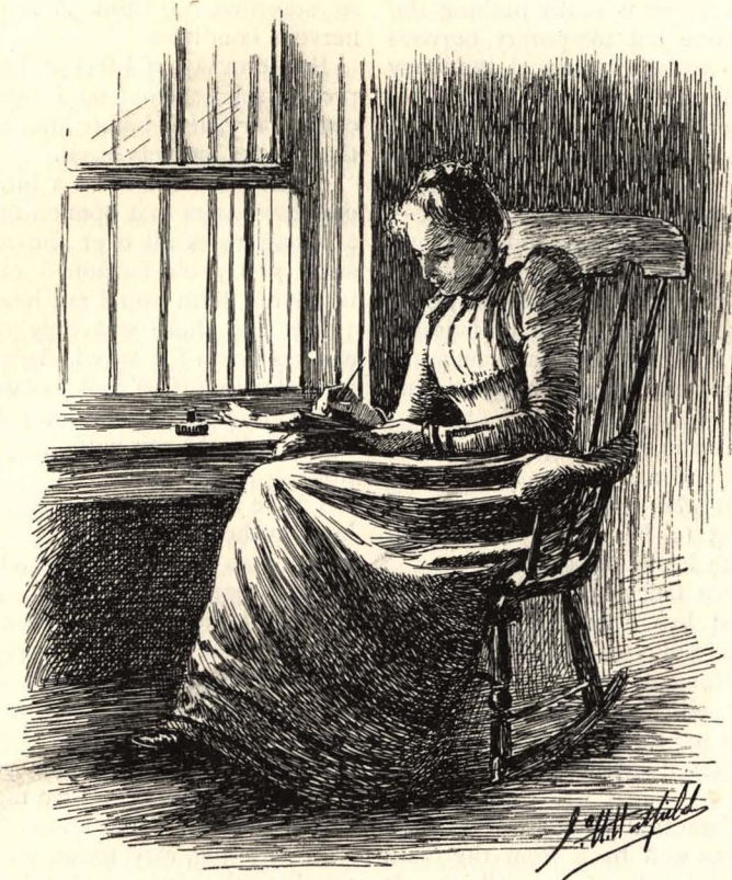
"I am sitting by the Window in this Atrocious Nursery."