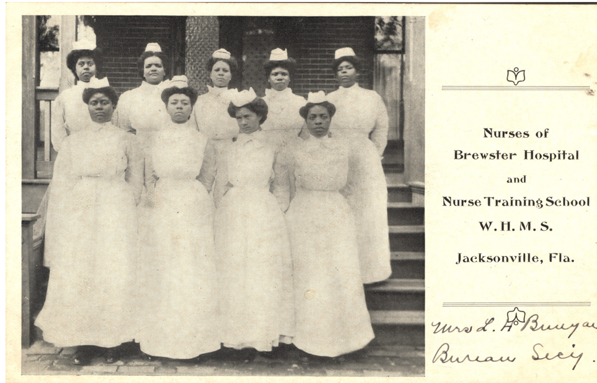
George A. Brewster Nurse Training School, Jacksonville, FL, ca. 1908