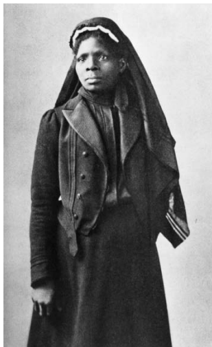
Susie King Taylor, c. 1902

“It seems strange how our aversion to seeing suffering is overcome in war ... and instead of turning away, how we hurry to assist in alleviating their pain, bind up their wounds, and press cool water to their parched lips, with feelings only of sympathy and pity.”